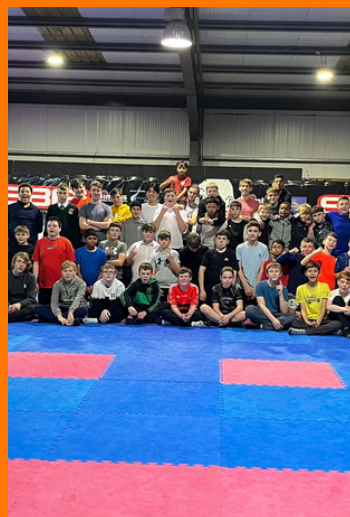
MMA at SGB