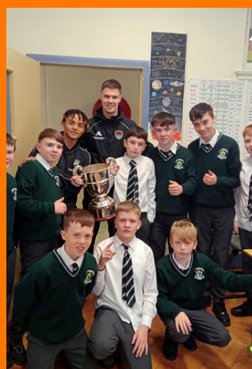
Visit from Cork City FC players (and past pupils!)