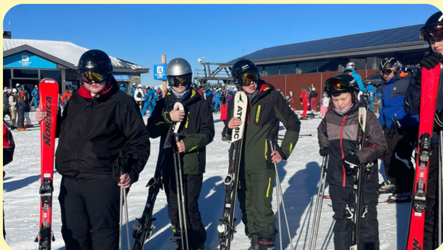
Getting ready to hit the slopes in Andorra!