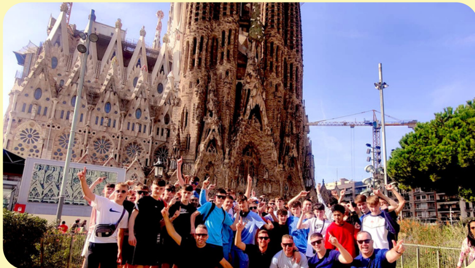
Visiting La Sagrada Familia Basilica in Barcelona

The European Tour is the highlight of many students time here in Chríost Rí. In past years students have spent time soaking up the sights in Amsterdam, Rome, Madrid, Munich and Barcelona.