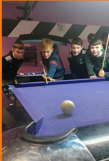
Playing Pool in the Leisureplex