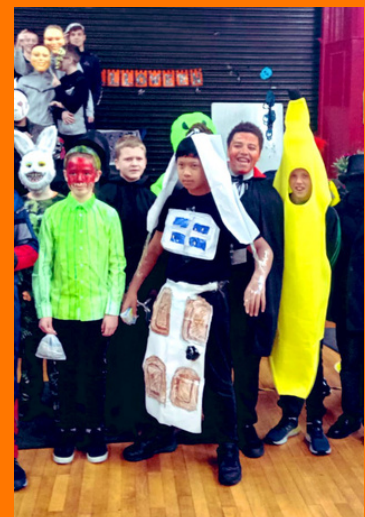
Halloween Fancy Dress