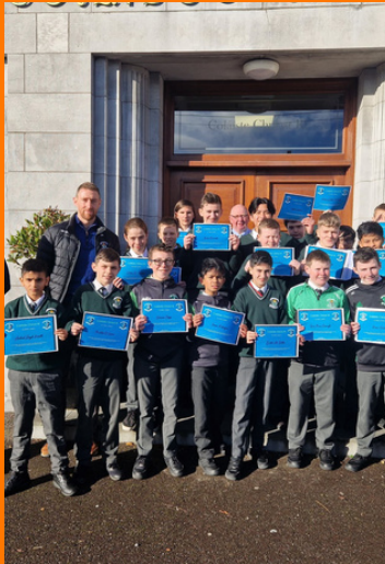
Academic Achievement Awards