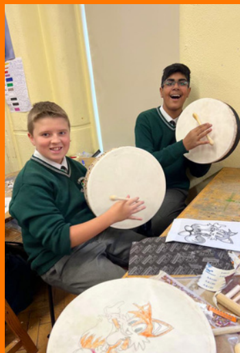
Bodhrán making in Art Club