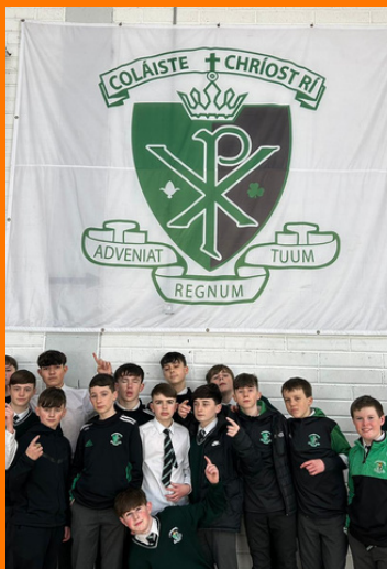
Seachtain na Gaeilge